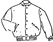
Style #70 Lettermens Jacket

ALL JACKETS WILL HAVE THE NDSRA LOGO EMBROIDERED ON THE BACK AND YOUR FIRST NAME ON FRONT. JACKETS ARE FOR MEMBERS ONLY